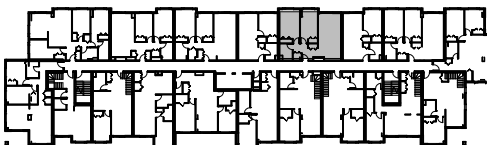
PLAN CLÉ KEY PLAN